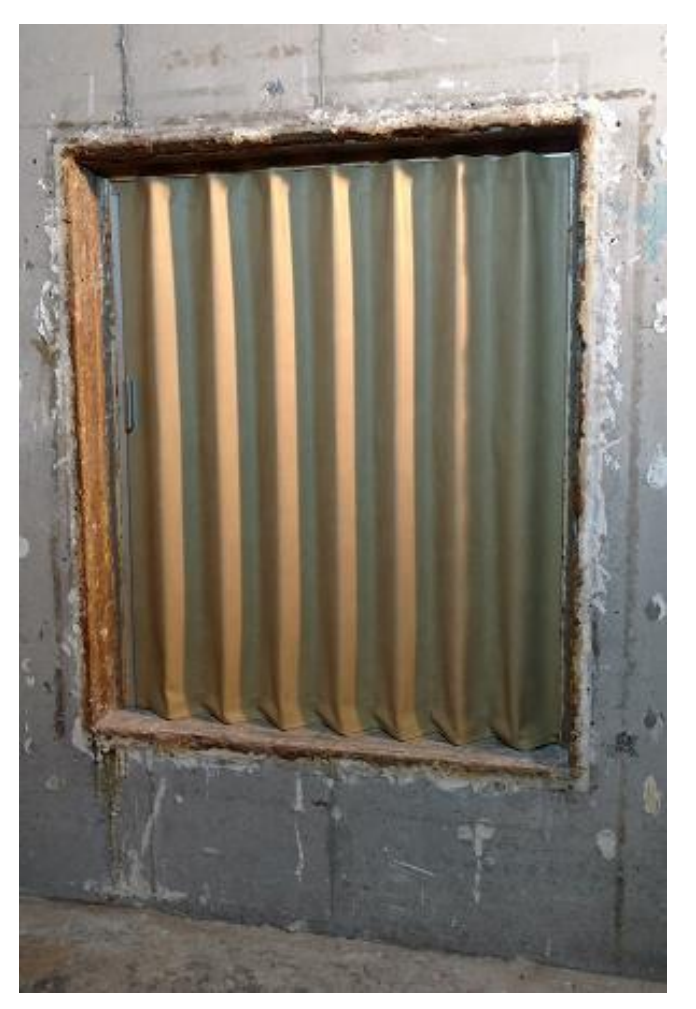
view in Receiving Room side